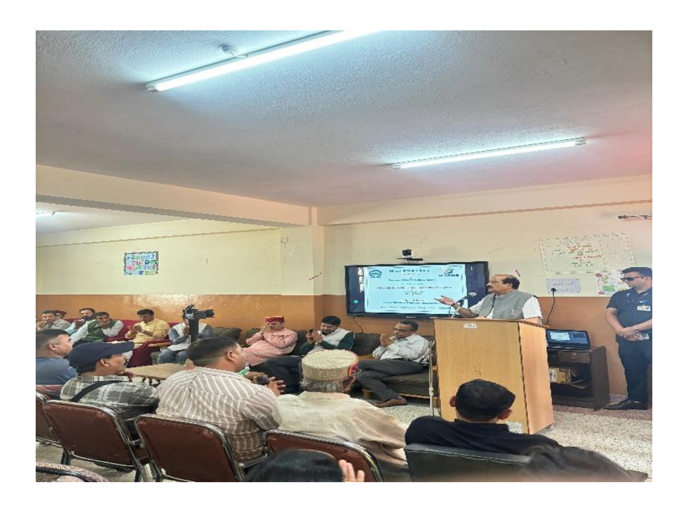
IQAC Coordinator Govt. Degree College Salooni Distt. Chamba, HP